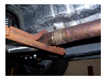
2. To remove the stock exhaust, unclamp it at the connection in front of the stock muffler. Disengage the welded hangers from the rubber grommets using WD-40 to aid in this process. Do not damage or remove the rubber grommets as you will re-use them to mount the new system.

1. Disconnect the negative battery cable before removal of OEM exhaust. This will allow the computer to reset and recognize the new exhaust. Lay out the exhaust on the floor so it looks like the drawing and compare parts with manual.