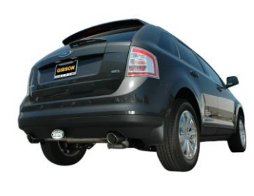
8. Install stainless steel tips. Clamp down. When you have everything in place, firmly tighten all bolts and clamps down securely. Use stainless steel cleaner and a Scotch Brite pad weekly to prevent tip from discoloration. Inspect all fasteners after 25-50 miles of operation and re-tighten as necessary.

5. Install extension pipe #C onto muffler outlet. Use clamp #H to secure the pipe to the muffler. Insert welded hanger into rubber grommet.